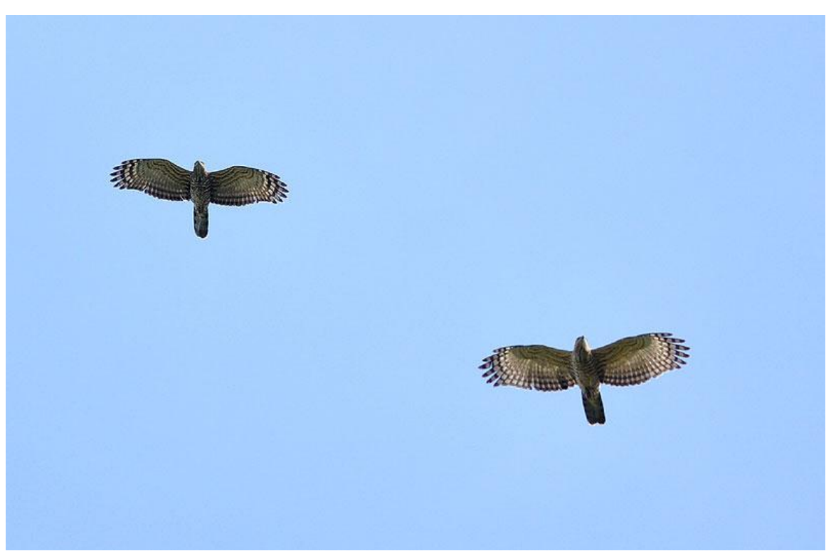
Figure 6. Jerdon's Baza, two of four birds in a migrating flock. 2009 October 26.