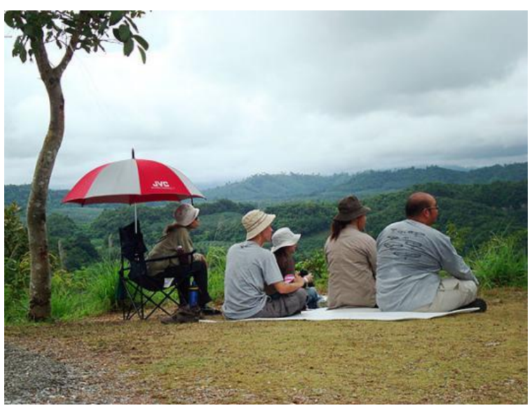
Figure 3. At the hill top, birders watching head-on raptors approaching from the east.