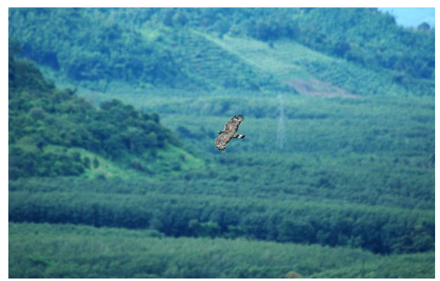
Figure 11. Bird-eye view of a male Oriental Honey Buzzard.