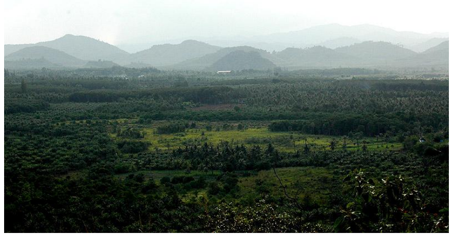
Figure 12. West view from Radar Hill with Tenasserim Mountain Range bordering Myanmar.