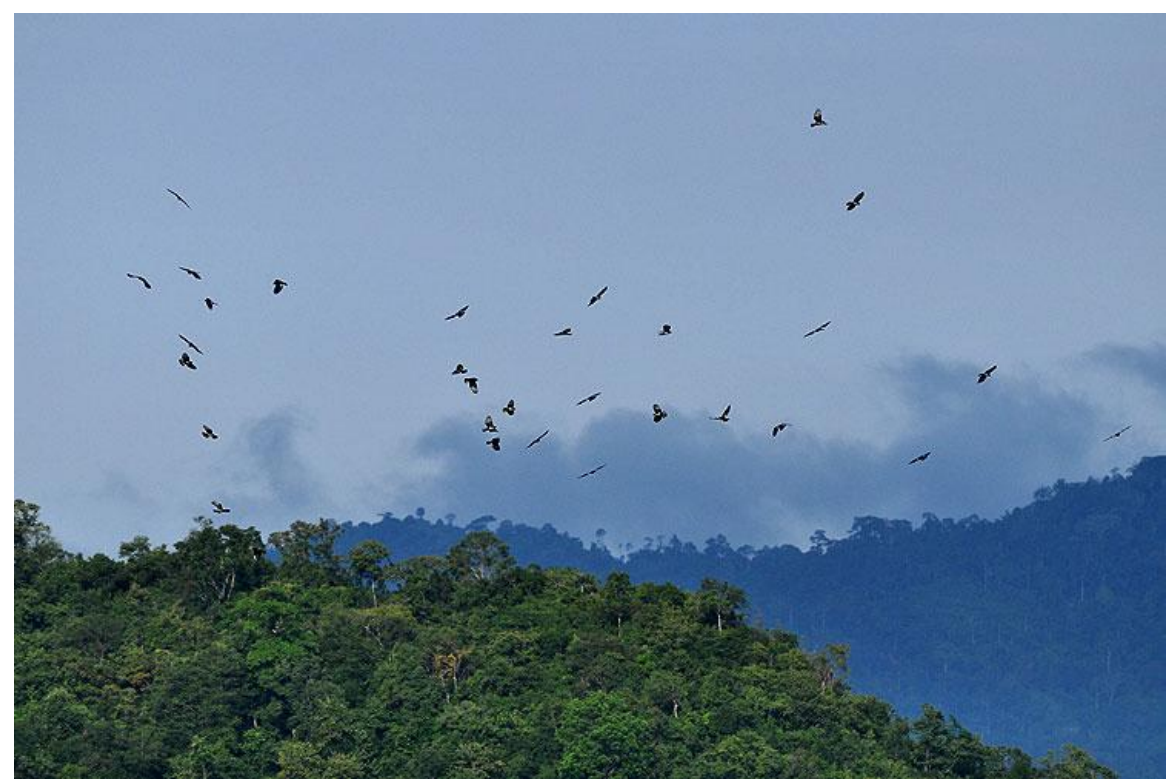
Figure 4. Kettle of Black Bazas. 2009 October 26.