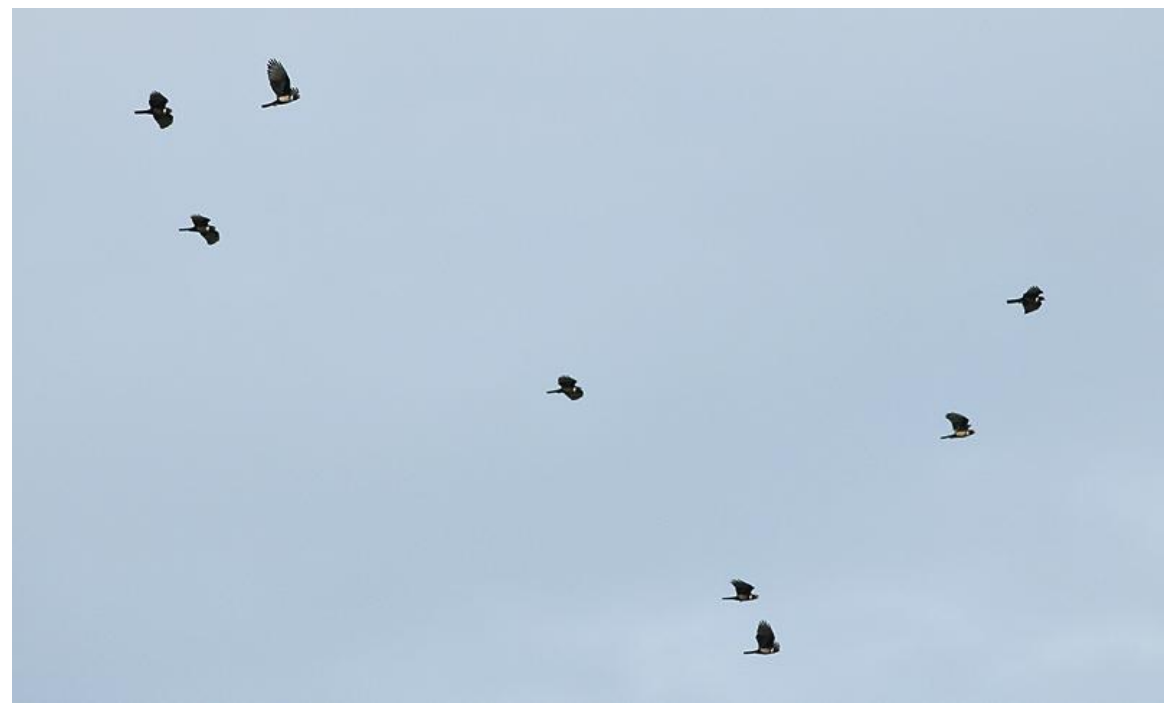
Figure 5. Eye-level view of Black Bazas. 2008 October.