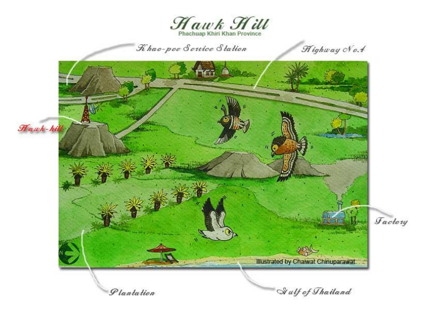
Figure 2. Map of Radar Hill (Hawk Hill) by Chaiwat Chinuparawat

identification in terms of species, sex-related and age-class plumages due to the diversity of species; for example the accipiters (one of the most ID challenging groups of Southeast Asian raptors, especially juvenile plumages), four species of migrants (Chinese Goshawk, Besra, Shikra, Japanese & Eurasian Sparrowhawk) and 1 residents (Crested Goshawk). The site is also good for raptor photography since raptors passing the hill different directions; overhead, eye-level (Fig. 5) and bird-eye view (Fig. 11), when raptors passing below the hill top. Many raptors approach the hill head-on, and can be viewed from afar. October is generally the best time to visit Radar Hill, offering a variety of species and number.