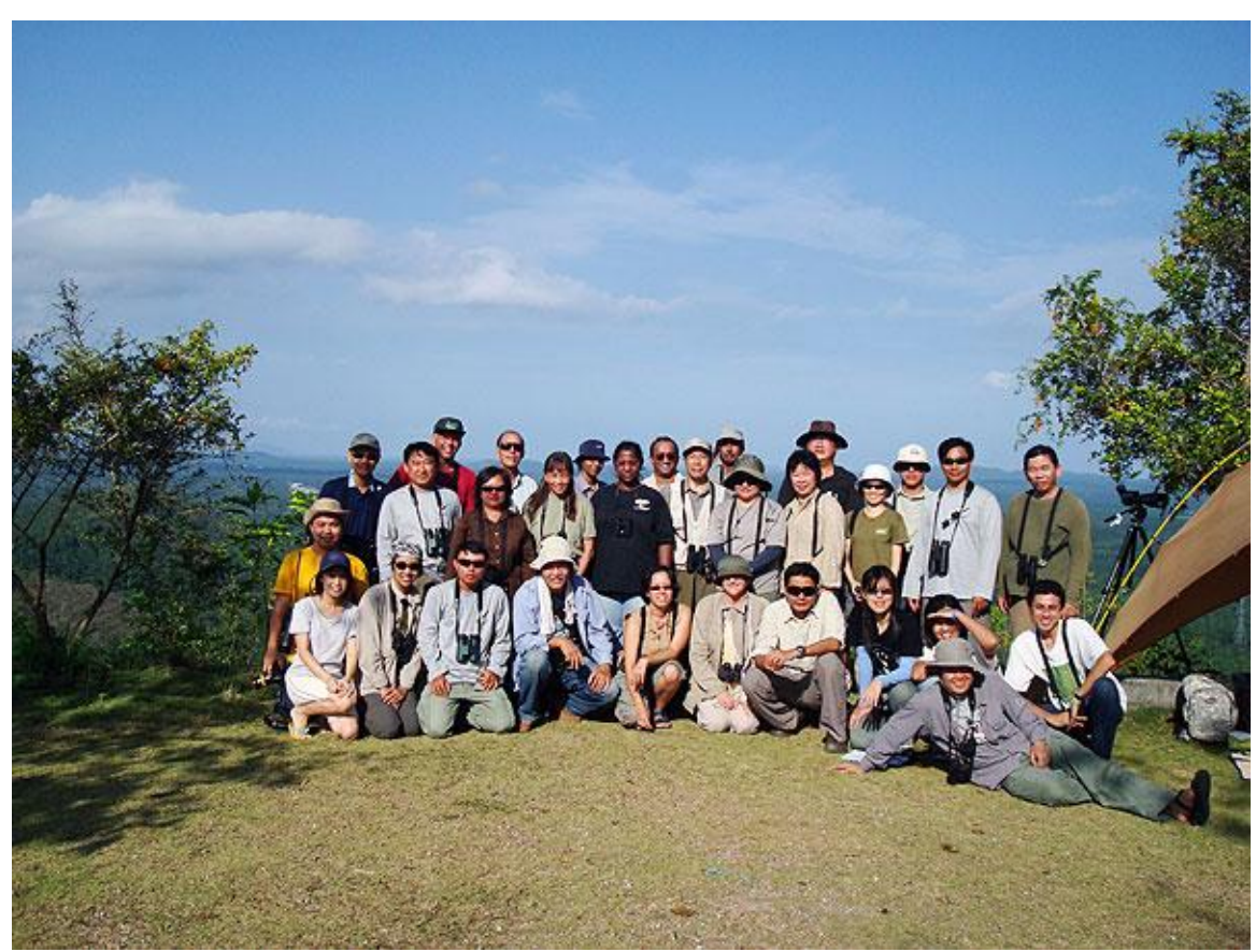
Figure 7. A raft of raptorphiles!