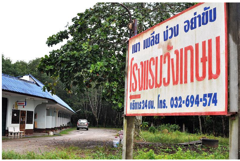
Figure 10. Wangkasem Hotel.

1. Wangkasem Hotel (โรงแรมวังเกษม). This is the closest basic hotel to Radar Hill and is within a walking distance (of 4.5 km) to the hilltop. It provides both fan and airconditioned rooms at a range of THB 250-500 per night. Laundry service is available. The hotel is c. 2 km south of Khao Pho service area. To get there, drive pass the service area and at the second U-turn, make a right turn back north and drive onto a small frontage road which runs parallel to the Highway #4 and the hotel will be on left-handed side with a big white sign (see following figure.). The hotel (Fig. 10) is also close (20 m) to Mr. Noi's Radar Hill Raptor Info Center. Contact phone: 032-694574 (home), 089-8667731 (mobile).