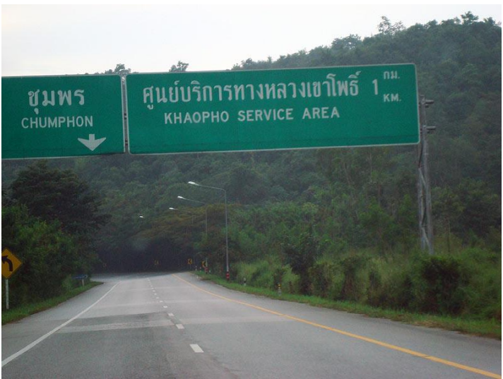
Figure 8. Highway 4 sign of Khao Pho service area. The left turn-off onto Radar Hill is just after this sign. Khao Pho is behind the sign on the right.

Radar Hill is a hill used by Thailand Authority of Telecommunication and Royal Thai Army. Two transmission towers are erected at the top of the hill at where is located in Ban (meaning a village) Chairat (บ้านใชยราช), Bang Saphannoi district, Prachuuap Khiri Khan Province. It is approximately 450 km from Bangkok and c. 70 km to Chumphon. The hill is opposite to Khao Pho service area (ศูนย์บริการทางหลวงเบาโพธิ์) on the Highway #4 (HW4; Phetkasem Road). Driving towards Chumphon and at km. post 431 + 800 m., turn left onto a small pavement road to the top of the hill. Visitors are kindly asked to park their vehicle on the road shoulder or a parking lot in front of a wooden house on the left side then walk up to the hill top (less than a distance of 100 m) in order to avoiding disturbance to the raptor watch activity due to limited parking space at the top. There is a gate at the foothill which is rarely locked. Visitors are also asked to keep the place clean by trash-in and trash-out.